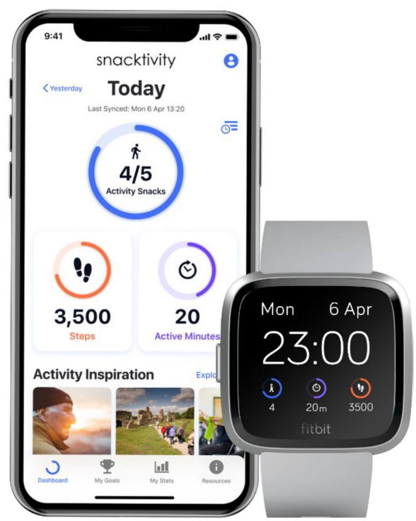
\textbf{Fig. 3} \;\; \mathsf{SnackApp}^{\mathsf{TM}} \; \mathsf{clockface}

The Fitbit Versa 2 collects various measures of physical activity data and displays these data using a bespoke SnackApp<sup>TM</sup> clockface (see Fig. 3). The SnackApp<sup>TM</sup> clockface, which is set as default, provides immediate feedback on the number of activity snacks, 'active