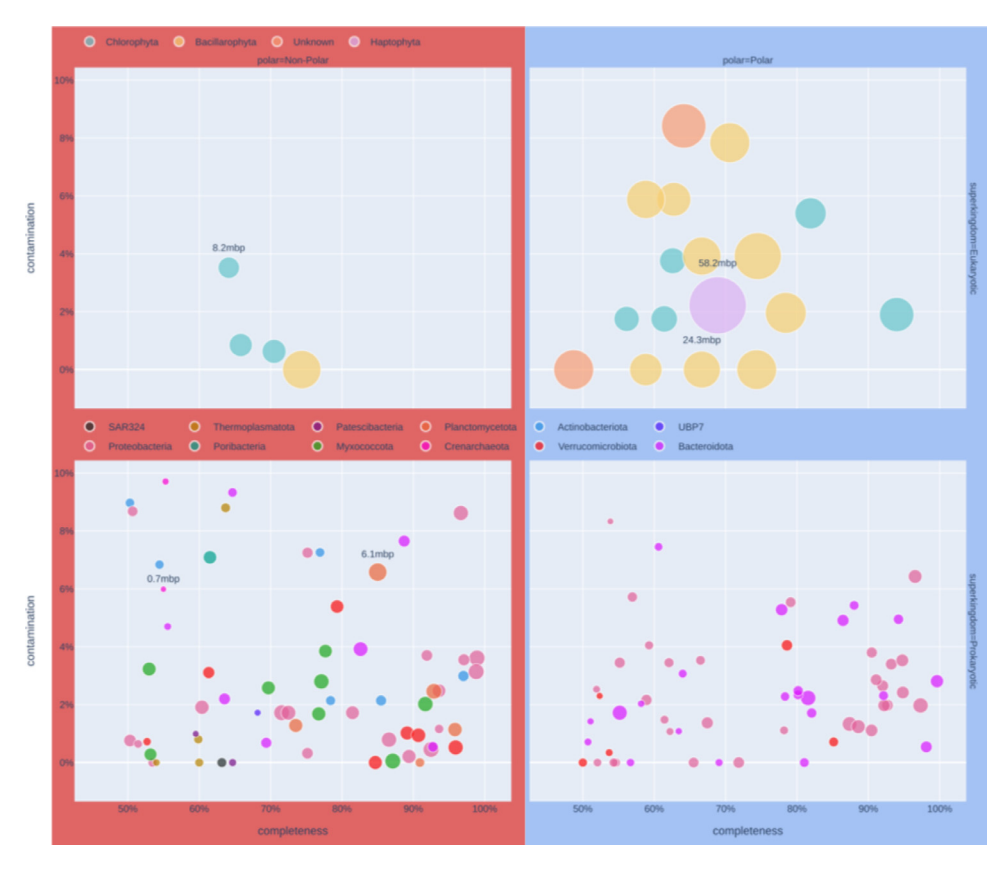
Fig. 2. Summary of MAGs included in this dataset. Left column (red) shows MAGs recovered from non-polar assemblies, right column (blue) those within the Arctic Circle. These are further divided by domain, the top row shows eukaryotes, and the bottom row prokaryotes. Each point represents a MAG, with the size of point representing length of DNA sequence in the MAG, and the colour an estimated taxonomy. Each point is placed based MAG quality, with the horizontal axis being completeness and vertical axis contamination, assessed using EukCC [14] for eukaryotes, and CheckM [15] for prokaryotes.