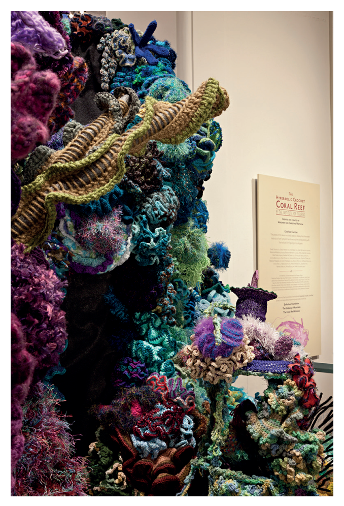
Figure 2. The Smithsonian Community Reef is a satellite of the worldwide Hyperbolic Crochet Coral Reef Project created by Margaret and Christine Wertheim of the Institute For Figuring in Los Angeles.

provided an effective way to raise awareness, its restorative impact on ocean ecosystems was obviously more limited. As Margaret Wertheim has prosaically observed of the project. 'Jolur efforts alone can't "save" coral reefs' (Wertheim 2015: 72). However, Wertheim maintained that the resultant reef 'installations may encourage viewers to stop for a moment and think about the power of little things' (Wertheim 2015: 72). As participatory projects, the crochet coral reefs emphasize that big things can be achieved through collaboration, with each participant plaving a small but fundamental part in the overall project, producing a single crocheted coral to contribute to the larger reef. These projects promote the idea that if everyone makes just a small change in behaviour towards the environment, the collective results have the capacity to achieve more than the sum of their parts.<sup>18</sup> As a result, the Crochet Coral Reef highlights the cumulative possibilities of the small acts of individuals (Wertheim and Aloi 2019: 180) and the meditative act of crafting provides time and space to reflect on the issues at stake in this work.