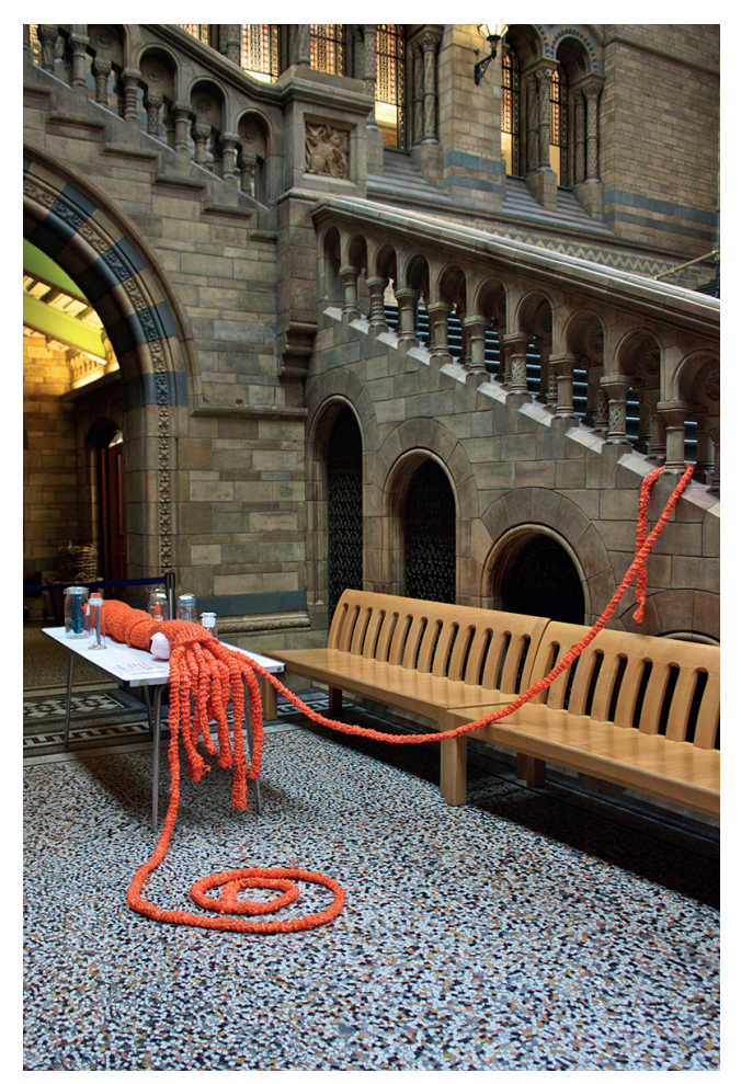
Figure 3. Lauren O'Farrell, 'Plarchie' the knitted giant squid (2010). Presented at the Natural History Museum, London.

studies scholar and ecocritic Ursula K. Heise has observed. risks losing its rhetorical edge by being such a predictable approach (Heise 2016: 53). Not only this, but the literary scholar Louise Economides has suggested that focusing solely on a negative sense of loss can impinde upon an individual's capacity to develop more positive ways of being, reducing the possibility for any environmental action to result from encounters with this work (Economides 2016: 136). While extinction studies scholars such as Thom Van Dooren have convincingly observed that grief and mourning, as more sombre emotional registers. can be transformational forces for change when addressing species loss (Van Dooren 2016: 139), a playful approach can be beneficial in the context of encounters with visual and material culture, providing an accessible and fresh take on environmental issues by adopting a more optimistic tone.