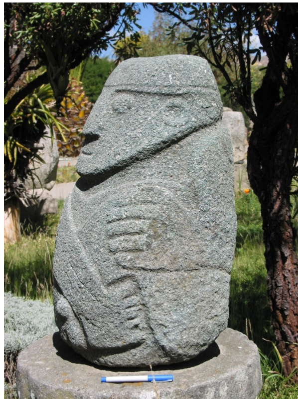
Figure 2. Stone monolith carved in the form of a seated, cross-legged mummy. Note the flat mask-like face, ear spool, and flexed and tucked position. Such effigies may have replaced disintegrated bundles or sought to show the lithification and enduring materiality of ancestors. Museo Arqueológico de Ancash, Huaraz.

The principal huaca idols tended to be the mummy bundles and large stones and monoliths (Figure 2). There were also numerous smaller and more portable cult objects, which the Spanish saw as “lesser idols” (Figure 3). 6 They had many local names but were referred to as chancas , conchuri ( Con Churi , cunchur ), and occasionally, huacicamayqs (“heads of houses”) 7 (Ávila, in Arguedas and Duviols 1966, pp. 255–56; Arriaga 1999, p. 35; Mills 1997, pp. 76–77, 84). 8 These were deemed family gods 9 and generally the charge of the living head member. They were passed down typically along hereditary or affinity lines. 10 As kinds of persons, they were considered vital, suprahuman members of the family, to whom offerings were made, and who were addressed in the same breath as parental and elder figures (Salomon and Urioste 1991, n366 and p. 86).