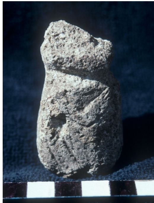
Figure 3. Small-sized ancestor figure excavated at Chinchawas. Note the flat mask-like face and seated position; height 6.4 cm, width 3.6 cm.

Reports of an extirpation visit sometimes concluded with a tally of its deeds and items that were collected for public destruction and confiscation (Table 1). Arriaga’s how-to extirpation manual (e.g., Arriaga 1999, p. 138) made this accounting official operating procedure for increasingly standardized monitoring. Those portable and flammable items were burned in public. Shrines were razed, and stone monuments were destroyed or buried on the spot. The reports provide a general sense of the relative numbers of cult objects involved. For example, over an eighteen-month period in 1617–1618, Arriaga (1999, p. 23) observed the removal and destruction of over 603 principal huacas , 189 huanacas , 617 mallquis , and 3418 conopas from the Cajatambo region alone. 11 This is roughly in the same order observed by the Augustinians during early evangelizing efforts in Huamachuco, which reported, in 1560, the destruction of over 3000 idols (Castro de Trelles 1992, p. 39).