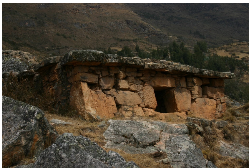
Figure 5. Typical aboveground mausoleum ( chullpa ), near Pampa Chacra, Peru; approximately 3 m wide. Large, flat roofing slabs protected a low, single-chambered interior. Small highly visible doorways allowed periodic access for small descendant collectives.

The mausolea were repositories to keep and retrieve the human remains and cult articles (Figure 6) for various post-mortem treatments and handling (Isbell 1997). Earlier constructions were usually single chambered, but later, the mausolea grew larger and more complex. Some tombs were large enough to accommodate the bundled interments of extended families or small kin groups over many generations, very similar to the pattern detailed in the Idolatries. Further, these buildings were not permanently sealed or buried. Small, highly visible doorways (Figure 5) allowed relatively easy access to the chambers' contents, including the burials and offerings.