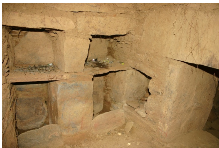
Figure 6. Interior of a chullpa structure, near Roko Amá, showing built-in compartments for the storage of special cult objects and paraphernalia. Today, they contain offerings made to the building's spirits, in the form of coca leaves, sweets, and sacrifices of guinea pigs.

The mausolea were repositories to keep and retrieve the human remains and cult articles (Figure 6) for various post-mortem treatments and handling (Isbell 1997). Earlier constructions were usually single chambered, but later, the mausolea grew larger and more complex. Some tombs were large enough to accommodate the bundled interments of extended families or small kin groups over many generations, very similar to the pattern detailed in the Idolatries. Further, these buildings were not permanently sealed or buried. Small, highly visible doorways (Figure 5) allowed relatively easy access to the chambers' contents, including the burials and offerings.