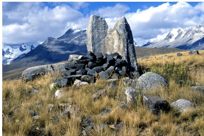
Figure 1. Standing stone uprights ( huancas ) at the foot of the Cordillera Blanca, above the city of Huaraz. Passersby have left stones to create an apacheta pile.

In particular, the colonial writings shed light on the widespread highland pattern of veneration of superhuman ancestral beings who took tangible physical forms (e.g., Dean 2010; Duviols 1979; Lau 2008, 2016). Usually these images were lithic forms: rounded pebbles, jagged rocks, boulders, uprights (Figure 1), and outcrops. 2 They could be portable or stationary, small and large. Mountains (Castro de Trelles 1992; Salomon and Urioste 1991) were the ultimate embodiments on the landscape (Gose 2006, 2016). Spanish priests called many such forms huacas (also guacas ), a term they used synonymously with "idols". 3 This pairing emerged out of the Christian gaze targeting their status both as tangible things and as false gods. The lithic material often had distinctive qualities, such as translucence, luster, mottling or striping, and smoothness. Unusual features could also be important: holes, protuberances, or natural features that approximated anthropomorphic or zoomorphic parts (e.g., eyes, mouths, limbs). The stones may have also been modified through shaping and carving (e.g., Lau 2016).