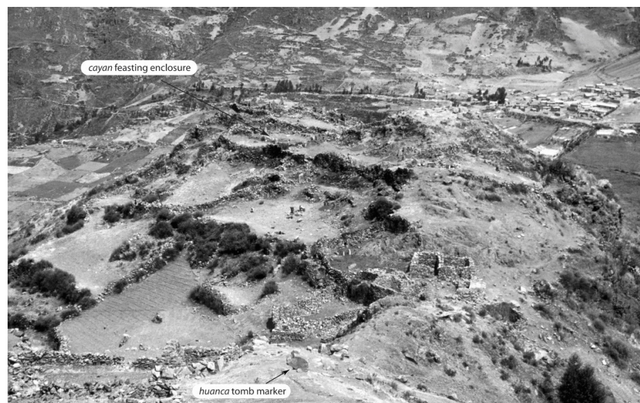
Figure 7. Photograph of Chinchawas, showing the main settlement mound and locations of a ceremonial enclosure (perhaps a ‘ cayan ’) and a standing upright ( huanca ). Over 40 carved stone monoliths were identified across the site.

The Idolatries accounts also mentioned walled open areas, just outside or near the tombs, that were places where effigies and cult idols would be brought out and feted. These were called cayan , located on terraces or platforms (Figure 7). Such spaces have been found near funerary structures, often with evidence of offerings, intensive feasting, and stone sculpture. The spaces are irregular, with walls of variable height, and measure roughly 10–15 m on a side; this is consistent with use by relatively small ritual collectives, likely in the order of dozens of people, rather than hundreds or more (Bria 2017; Gero 1991; Ibarra 2009; Lau 2002; Paredes 2012). Sampling excavations have found offering caches directly outside of chullpas , often of miniature vessels.