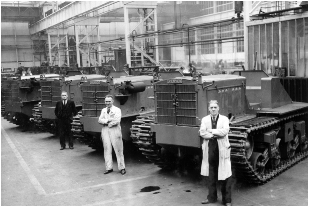
Shervick tractors at the Vickers-Armstrong factory in Newcastle-Upon-Tyne, 1948.

bombers were kitted out to survey and discover “new country” in East Africa for agricultural development. At the sites chosen for the groundnut scheme, tractors and bulldozers from military surplus stores in Egypt proved unable to tackle the hard ground and tough vegetation, so the planners turned to a novel solution: repurposing surplus Sherman M4A2 tanks. The Vickers-Armstrong factory in Newcastle-Upon-Tyne set about rearranging key elements of the tanks’ construction into a new configuration, with an open cockpit and a shortened caterpillar track. The tractors, christened “Shervicks” for their hybrid origins, were designed to be multi-purpose machines, but were thought to be particularly suited to large-scale earth-moving and to the kind of heavy duty “bush clearing” that was required in Tanganyika.