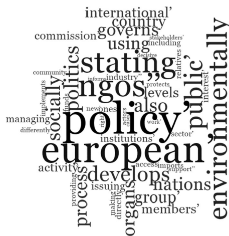
Fig. 4 NGO frame

Correspondingly, researchers use civil society ideas in three broad ways (Keane 2010): as an ‘idealtyp’ in empirical investigations of its origins and nature; in pragmatic ways, where ‘strategic usages of the term have an eye for defining what must or must not be done’ (p. 463); or normatively, where civil society stands for an expression