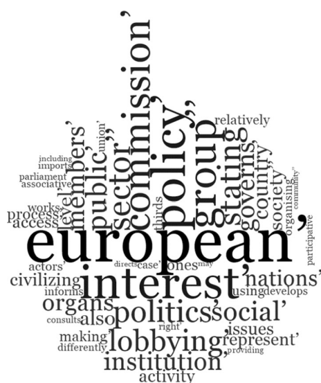
Fig. 6 Multiple frames

The three most popular frames on non-state actors in the EU emerging from the bibliographic analysis are ‘interest group’, ‘NGO’, ‘civil society organisation’, and the publications using multiple frames. Frame contents indicate that these connect with liberal democracy and pluralism (interest groups), governance (NGO), and deliberative/participatory democracy (CSO) ideals of the European polity. See Table 2.