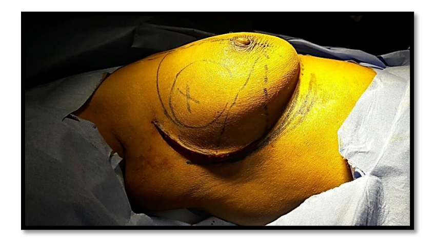
Figure 2: Intraoperative image shows the incision and flap elevation also x indicates the site of the tumor.