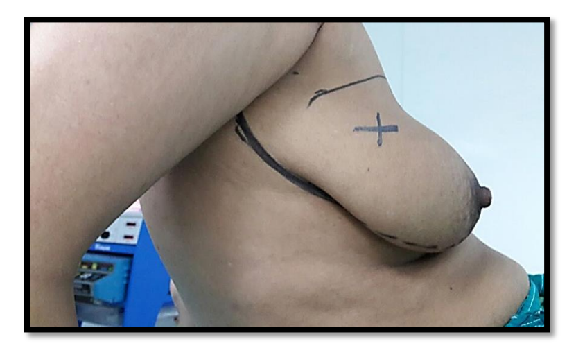
Figure 1: Preoperative image Shows incision planning. Figure x indicates the site of the tumor.