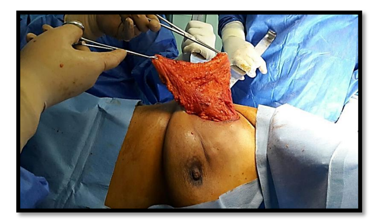
Figure 4: Intraoperative image shows delivery of the flap through axillary incision.