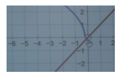
Figure 1: y = x and y = \sqrt{-4x - 1} on Autograph

x = \frac{-1}{x+4} . George graphed y = x and y = \frac{-1}{x+4} on Autograph (Figure 2) and commented that the two graphs crossed this time at two points. Having noted that the two points are close to x = -0.2 and x = -3, George explained that the Iterative method is based on replacing the x in the denominator of this rearrangement by x_n and replacing the isolated x by x_{n+1} . Thus, he suggested the formula x_{n+1} = \frac{-1}{x_n+4} to be used to complete the table in Figure 3 with a starting value x_0 = 1 . This shows how George used different representations such as tables and graphs; and tried to create connections between procedures and also between different resources (student's contribution + Autograph).