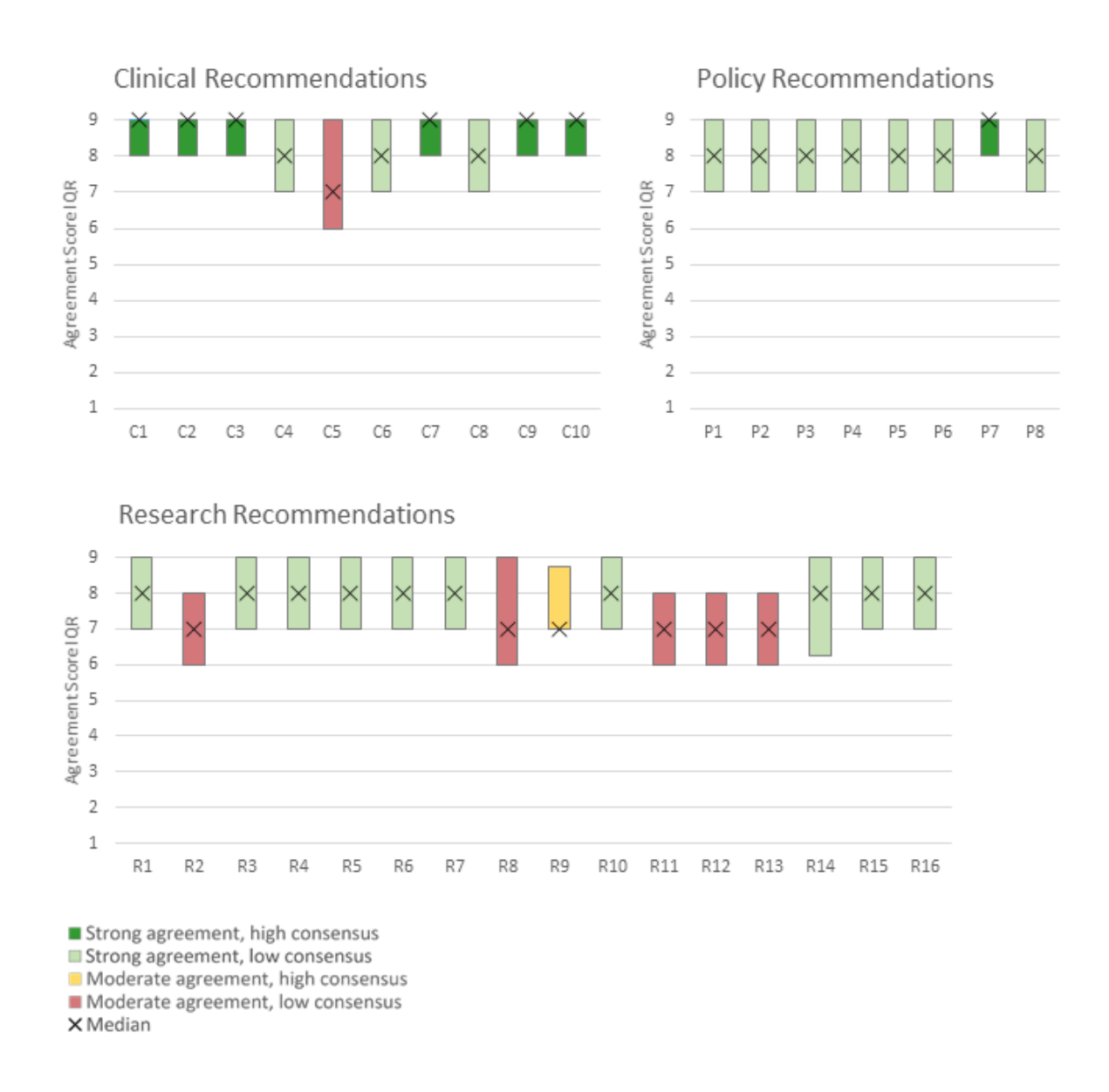
Figure 3: Boxplots of online consensus survey scores