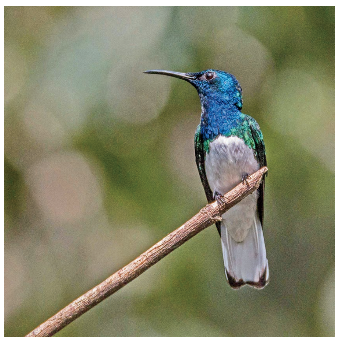
White-Necked Jacobin Hummingbird, Belize