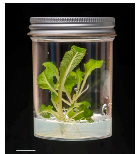
Fig. 2. Regeneration and rooting of Primula vulgaris plantlets. Plantlet after 4 weeks growth on a phytagel woody plant medium with 0.5 mg·L -1 indole-3-butyric acid. Scale bar = 1 cm.

2,4-D, 2.0 mg·L -1 TDZ for 4 weeks, followed by a further 8 weeks on PSR medium supplemented 3.0 mg·L -1 TDZ, 0.3 mg·L -1 NAA, and 3.4 mg·L -1 AgNO 3 . The isolation and rooting of plantlets on WPM began after 5 weeks on PSR medium. A subset of three P. vulgaris 'Sue Jervis' plantlets were transferred to soil and successfully acclimatized.